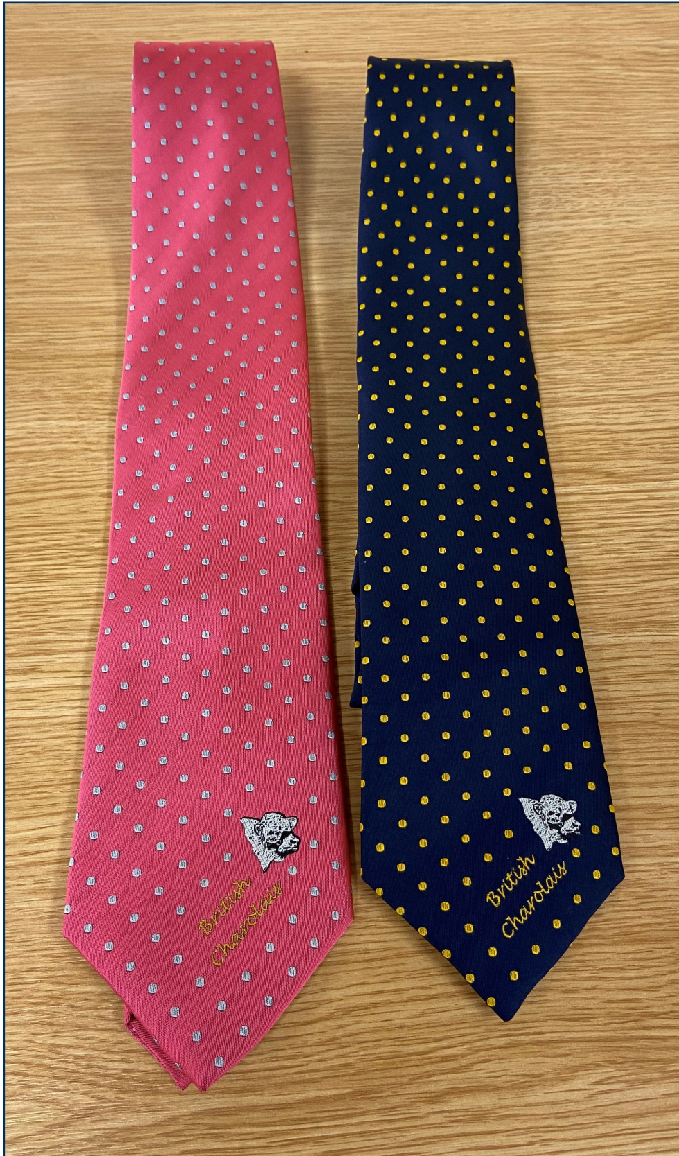
Polka dot Tie Navy or Pink £10.00