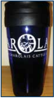
Insulated Travel Mug £6.00