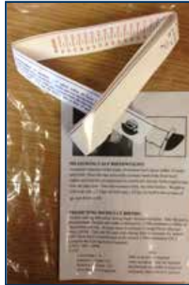
Measuring Tape £5.00