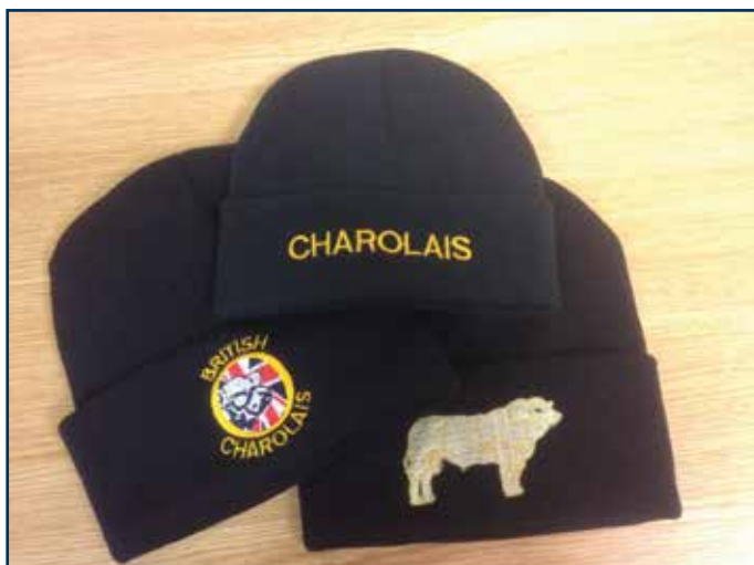
New Wool Hats Bull, Charolais or Logo £6.00