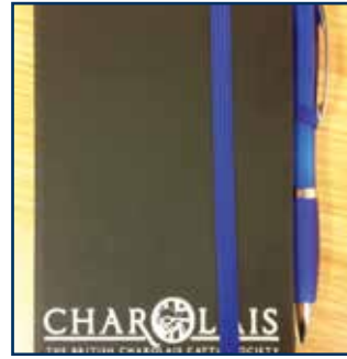
Notebook & Pen £3.50