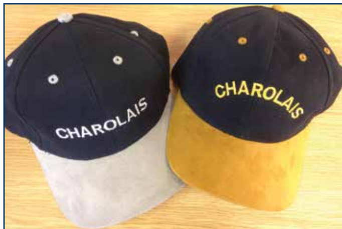
Baseball Cap Suede Peak Silver or Gold £8.00