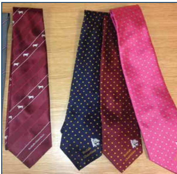
Polka dot Tie Burgandy, Navy or Pink £10.00 Burgundy Bull and stripe tie £10.00