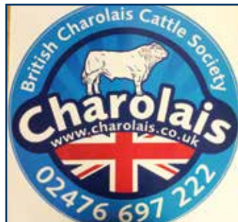
Lorry Sticker £6.00