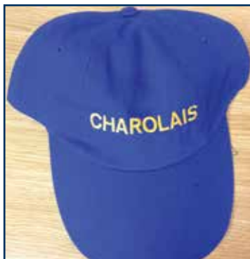
Baseball Cap Cotton Royal £6.00